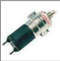
Advanced infrared point gas detector