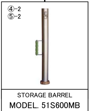
STORAGE BARREL MODEL. 51S600MB