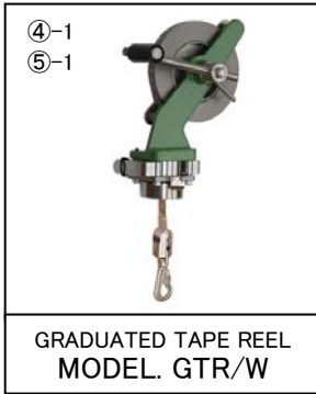
GRADUATED TAPE REEL MODEL. GTR/W