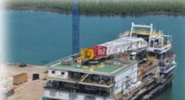
74m Offshore Drill Barge