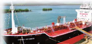
108m 6,500 DWT Clean Product Tanker