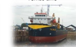
MV "Palung Mas" from Temas Line