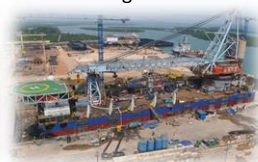
Crane Barge HD 2500