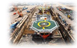
MV Energy Miner