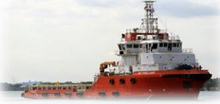
66m 8,080hp AHTS , DP2, FiFi 1