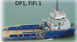
60m 5,380hp AHTS , DP1, FiFi 1