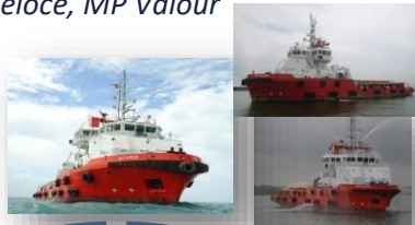
5,000+ BHP series: MP Veloce, MP Valour