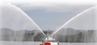
70m 8,160hp AHTS vsl 110T BP, DP2, FiFi 1