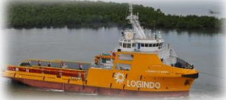
70m 8,160hp AHTS, 110 tons BP