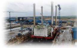
Jack Up Barge Innomarine 1