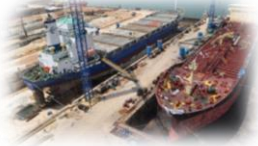
MV CTP Golden