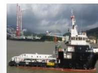
MP Manuver: 6,500 BHP DP2 AHTS