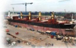
MV Ocean Pride