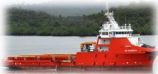
76m 12,000 BHP - 150 tons BP