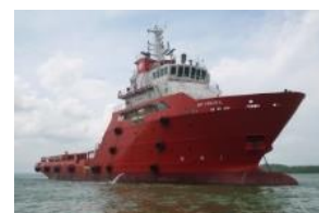
MP Prevail: 9,000 BHP AHTS, DP2