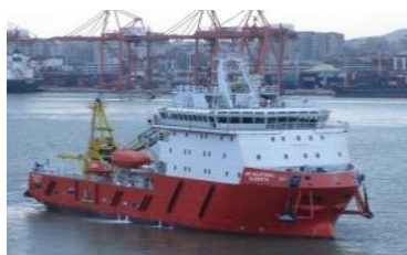
MP Nautical Aleesya